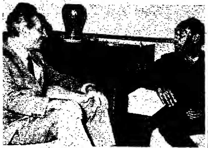
Labour Party chairman Shimon Peres chats with Egyptian President Anwar Sadat during their meeting yesterday at Sadat's Alexandria summer palace.